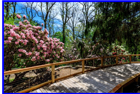
Heritage Museums & Gardens

Visit the Heritage Museums & Gardens in Sandwich, MA. Heritage offers one hundred acres of trees, shrubs, flowers, and sweeping lawns. Be sure to visit the JK Lilly III Automobile Collection Museum , the American History Museum , and the Art Museum featuring an operating, hand-carved Carousel made in 1912. Also, featured, is the Old East Windmill built in 1800 which was moved from Orleans to Heritage in 1968.