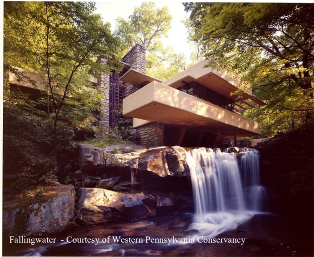
Fallingwater

Saturday July 26, 2025 Thursday October 2, 2025