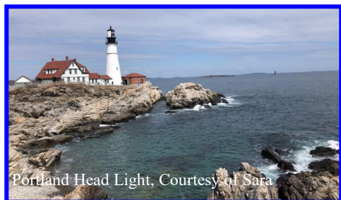
Portland Head Light