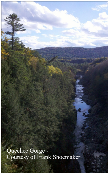
Quechee Gorge

Day 5: You will enjoy the splendor of Maine and its seacoast towns.