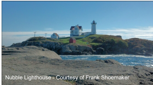
Nubble Lighthouse

Time to dine, explore, shop, and browse in Dock Square .